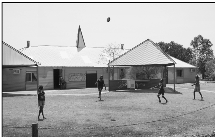
Playing football in the school yard at Kulkarriya Community School

The graphs show also the significant fall in the number of children who are non-readers. And, as these graphs represent the pooled reading result across all year levels, it is important to realise that the 29% labelled non-readers in the post test graph includes a significant proportion of year 1 children who make up 16 % of the total assessed school population. Thus, from a situation where a majority of children were classified as non-readers, we now have an environment where the vast majority are engaging and making strong progress in their reading development.