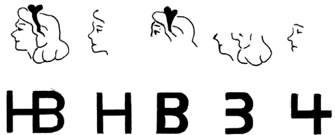
Fig. 1. The shapes into which the profile of a female head and the monogram, HB disintegrate when they are fixed with respect to the movement of the retina (adapted from Pritchard, 1971).

The common visual mechanisms relating to points of high contrast shared by the two kinds of stimuli are evident in research with newborn infants. Within days of birth, if not at birth, infants are sensitive to the sharp changes in luminance as reflected in their eye movements (Bronson, 1997). As shown in Fig. 2, newborns fixate on the apex of the figure where the luminance gradients are most pronounced.