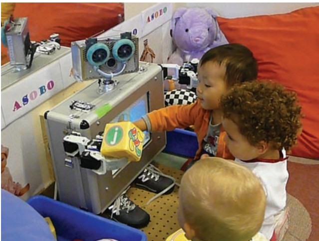
Fig. 4. A social robot can operate autonomously with children in a preschool setting. In this photo, toddlers play a game with the robot. One long-term goal is to engineer systems that test whether young children can learn a foreign language through interactions with a talking robot.

The science of learning has also affected the design of interventions with children with disabilities. Speech perception requires the ability to perceive changes in the speech signal on the time scale of milliseconds, and neural mechanisms for plasticity in the developing brain are tuned to these signals. Behavioral and brain imaging experiments suggest that children with dyslexia have difficulties processing rapid auditory signals; computer programs that train the neural systems responsible for such processing are helping children with dyslexia improve language and literacy (76). The temporal "stretching" of acoustic distinctions that these programs use is reminiscent of infant-directed speech ("motherese") spoken to infants in natural interaction (77). Children with autism spectrum disorders (ASD) have deficits in imitative learning and gaze following (78–80). This cuts them off from the rich socially mediated learning opportunities available to typically developing children, with cascading developmental effects. Young children with ASD prefer an acoustically matched nonspeech signal over motherese, and the degree of preference predicts the degree of severity of their clinical autistic symptoms (81). Children