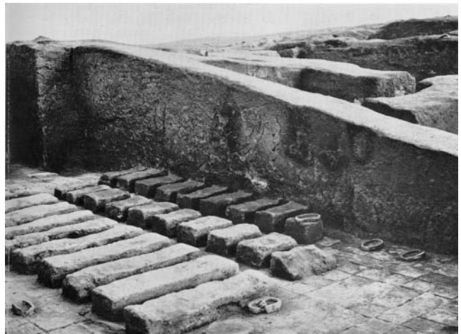
FIGURE 1. Photo of earliest known example of a school, an Assyrian classroom circa 2000 BCE.

At the time, knowledge about methods of record keeping, esoteric lists of objects, and the means for creating them were seen as imbued with special powers such as are currently ascribed to those who are “highly educated.” And it was clearly recognized that socioeconomic value flowed from this knowledge. As one early Egyptian father admonished his son several thousand years ago,