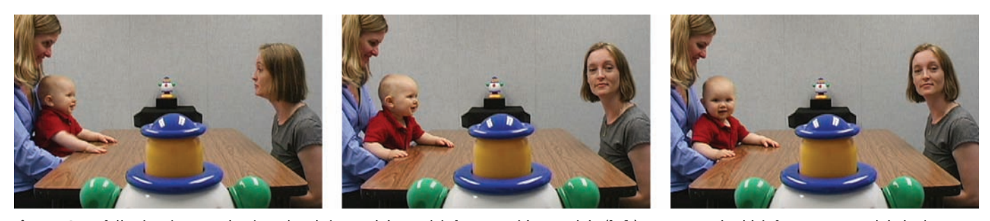
Fig. 2. Gaze following is a mechanism that brings adults and infants into perceptual contact with the same objects and events in the world, facilitating word learning and social communication. After interacting

Shared attention. Social learning is facilitated when people share attention. Shared attention to the same object or event provides a common ground for communication and teaching. An early component of shared attention is gaze following (Fig. 2). Infants in the first half year of life look more often in the direction of an adult's head turn when peripheral targets are in the visual field (31). By 9 months of age, infants interacting with a responsive robot follow its head movements, and the timing and contingencies, not just the visual appearance of the robot, appear to be key (32). It is unclear, however, whether young infants are trying to look at what another is seeing or are simply tracking head movements. By 12 months, sensitivity to the direction and state of the eyes exists, not just sensitivity to the direction of head turning. If a person with eyes open turns to one of