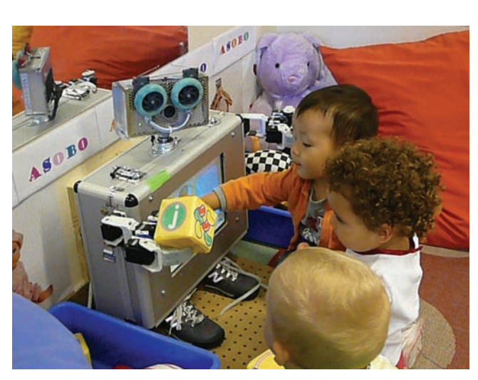
Fig. 4. A social robot can operate autonomously with children in a preschool setting. In this photo, toddlers play a game with the robot. One long-term goal is to engineer systems that test whether young children can learn a foreign language through interactions with a talking robot.

The science of learning has also affected the design of interventions with children with disabilities. Speech perception requires the ability to perceive changes in the speech signal on the time scale of milliseconds, and neural mechanisms for plasticity in the developing brain are tuned to these signals. Behavioral and brain imaging experiments suggest that children with dyslexia have difficulties processing rapid auditory signals; computer programs that train the neural systems responsible for such processing are helping children with dyslexia improve language and literacy (76). The temporal "stretching" of acoustic distinctions that these programs use is reminiscent of infantdirected speech ("motherese") spoken to infants in natural interaction (77). Children with autism spectrum disorders (ASD) have deficits in imitative learning and gaze following (78-80). This cuts them off from the rich socially mediated learning opportunities available to typically developing children, with cascading developmental effects. Young children with ASD prefer an acoustically matched nonspeech signal over motherese, and the degree of preference predicts the degree of severity of their clinical autistic symptoms (81). Children