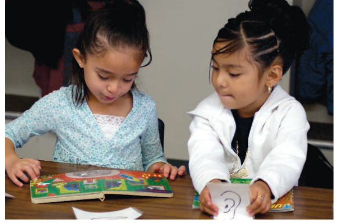
"Buddy reading." Two preschoolers engaged in Tools activity. The ear linedrawing held by one guides her attention (2).

agreed to randomly assign teachers and children to these two curricula. Our study included 18 classrooms initially and added 3 more per condition the next year. Quality standards were set by the state. All classrooms received exactly the same resources and the same amounts of teacher training and support (2). Stratified random assign-