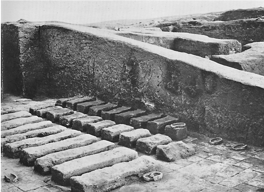
Fig. 1. Excavation of an early classroom from Sumer.

jects by inscriptions on tokens and the elaboration of the first writing system, cuneiform, which evolved slowly over time. Initially the system was used almost exclusively for record keeping but evolved to represent not only objects but the sounds of language, enabling letter writing and the recording of religious texts [Larsen 1986; Schmandt-Besserat, 1996].